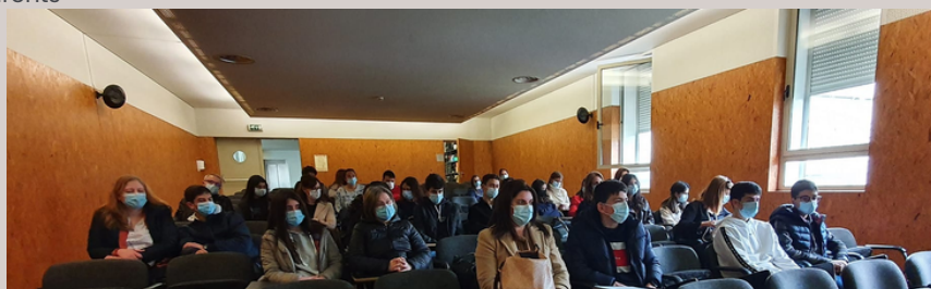
PT meeting with parents

Exploring Erasmus Opportunities: The meeting serves as an opportunity to introduce students and parents to the Erasmus+ programme, explaining its benefits, objectives, and the unique experiences it offers. Presenters discuss the advantages of going abroad, including academic growth, personal development, cultural exchange, and improved language skills.