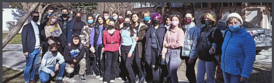
Romanian hosting team